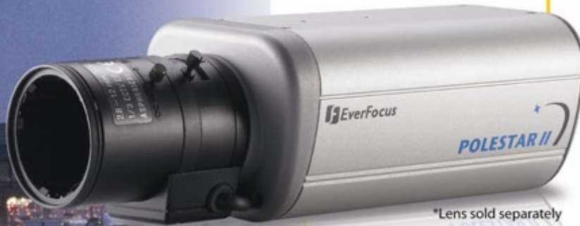
*Lens sold separately