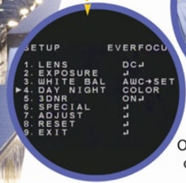
OSD Menu setup locally or remotely via RS-485