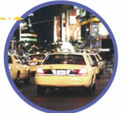
True Day/Night or Color in Low Light